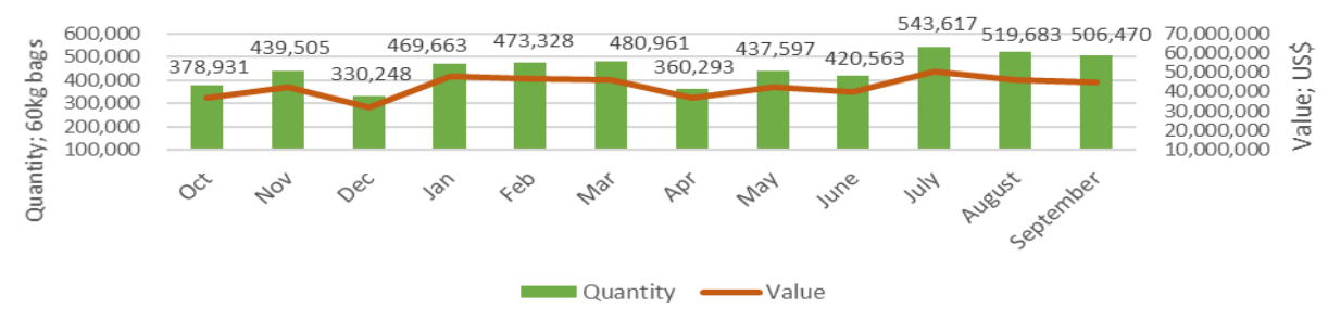
Table1: Comparison of Coffee Exports of September 2018/19 and 2019/20 Coffee Years