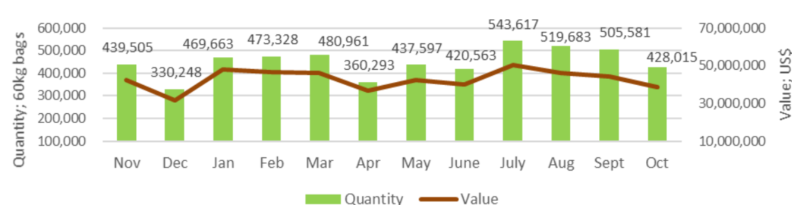
Fig 1: Trend of Total Quantity and Value of Coffee Exported: November 2019- October 2020

Coffee exports for the 12 months (November 2019-October 2020) amounted to 5,409,054 60-kilo bags worth US$ 513.99 million compared to 4,465,534 60-kilo bags valued at US$ 435.81 million the previous year. This represents 21.13% and 17.94% increase in both quantity and value respectively. (figure 1)