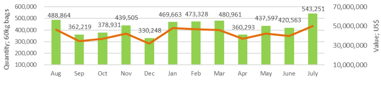
Fig 1: Trend of Total Quantity and Value of Coffee Exported: August 2019- July 2020