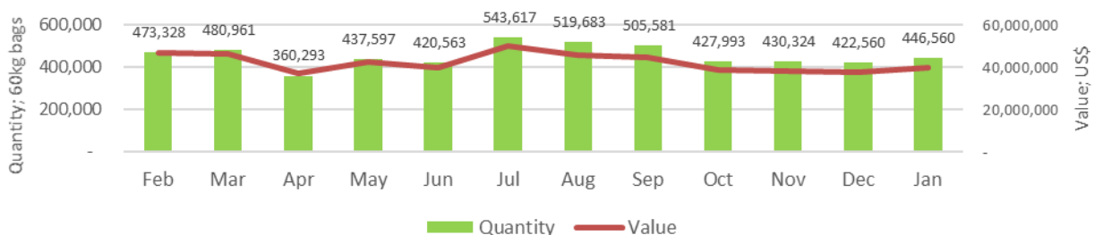
Table 1: Comparison of Coffee Exports of January 2019/20 and 2020/21 Coffee Years