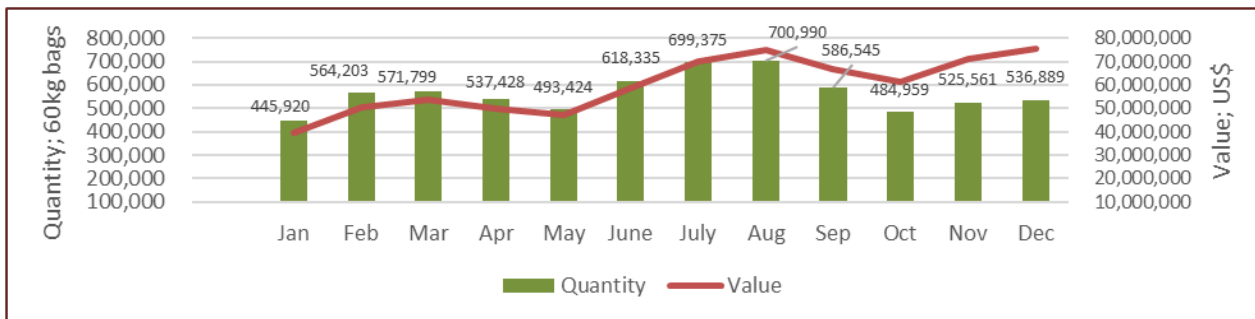
Fig 1: Trend of Total Quantity and Value of Coffee Exported: January 2021- December 2021

Coffee exports for the 12 months (January 2021-December 2021) amounted to 6,765,428 60-kilo bags worth US$ 718.57 million compared to 5,488,927 60-kilo bags valued at US$ 520.01 million the previous year (January 2020- December 2020). This represents 23.26% and 38.18% increase in both quantity and value respectively ( Figure 1 ).