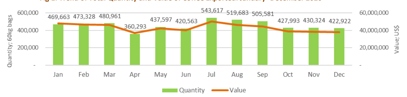
Table 1: Comparison of Coffee Exports of December 2019/20 and 2020/21 Coffee Years