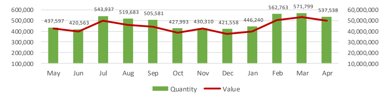
Table1: Comparison of Coffee Exports of April 2019/20 and 2020/21 Coffee Years